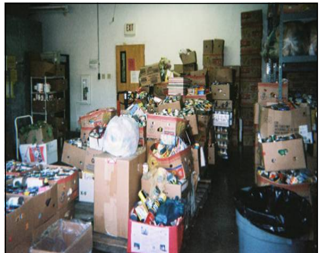
The garage full of food for the Holidays

Thanks to the many organizations and individual donors who responded to our need for food