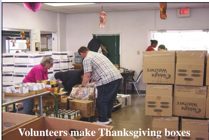
Volunteers make Thanksgiving boxes

Borden Milk Products - 3,120 pounds Keller Williams Realty - 2,673 pounds Buda Elementary School - 2,316 pounds SMHS Student Council - 1,661 pounds SMHS National Honor Society - 1,608 pounds San Marcos Chamber Ambassadors - 1,116 pounds Phoenix Rising Bakery - 1,114 pounds Bowie Elementary School - 1,028 pounds Mensor Corporation - 967 pounds City of San Marcos employees - 761 pounds Chi Alpha Christian Fellowship - 687 pounds Scudder Primary School - 600 pounds Fellowship of San Marcos - 580 pounds Hernandez Middle School - 524 pounds San Marcos Community Church - 521 pounds Kyle United Methodist Church - 497 pounds Travis Elementary School - 444 pounds CenturyTel - 471 pounds Hays High School - 430 pounds & $113 SMCISD Child Nutrition Services - 427 pounds National Job Corps Data Center - 408 pounds Texas State University - Chartwells - 406 pounds Texas State University - Student Affairs - 405 pounds D'Vries Chiropractic - 388 pounds Thermon - 349 pounds Fuentes Elementary School - 338 pounds Butler Manufacturing - 302 pounds KTSW-FM Radiothon - $550